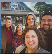
The King Family