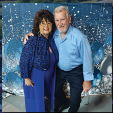
The Singing Byrds